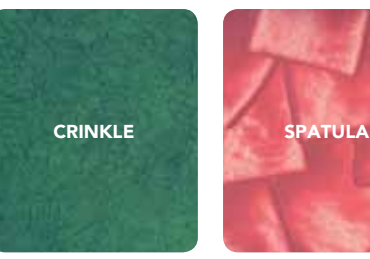
Tough Texture: Lasts long and ensures low maintenance