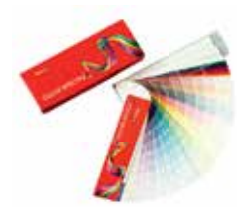
COLOUR SPECTRA FAN DECK*