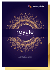
ROYALE INSPIRATION BOOK