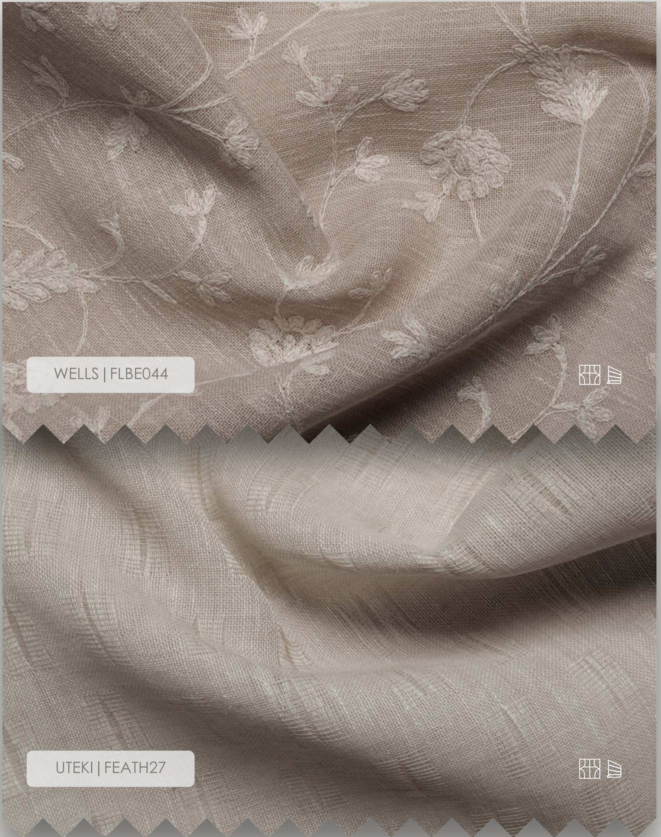
WELLS | FLBE044