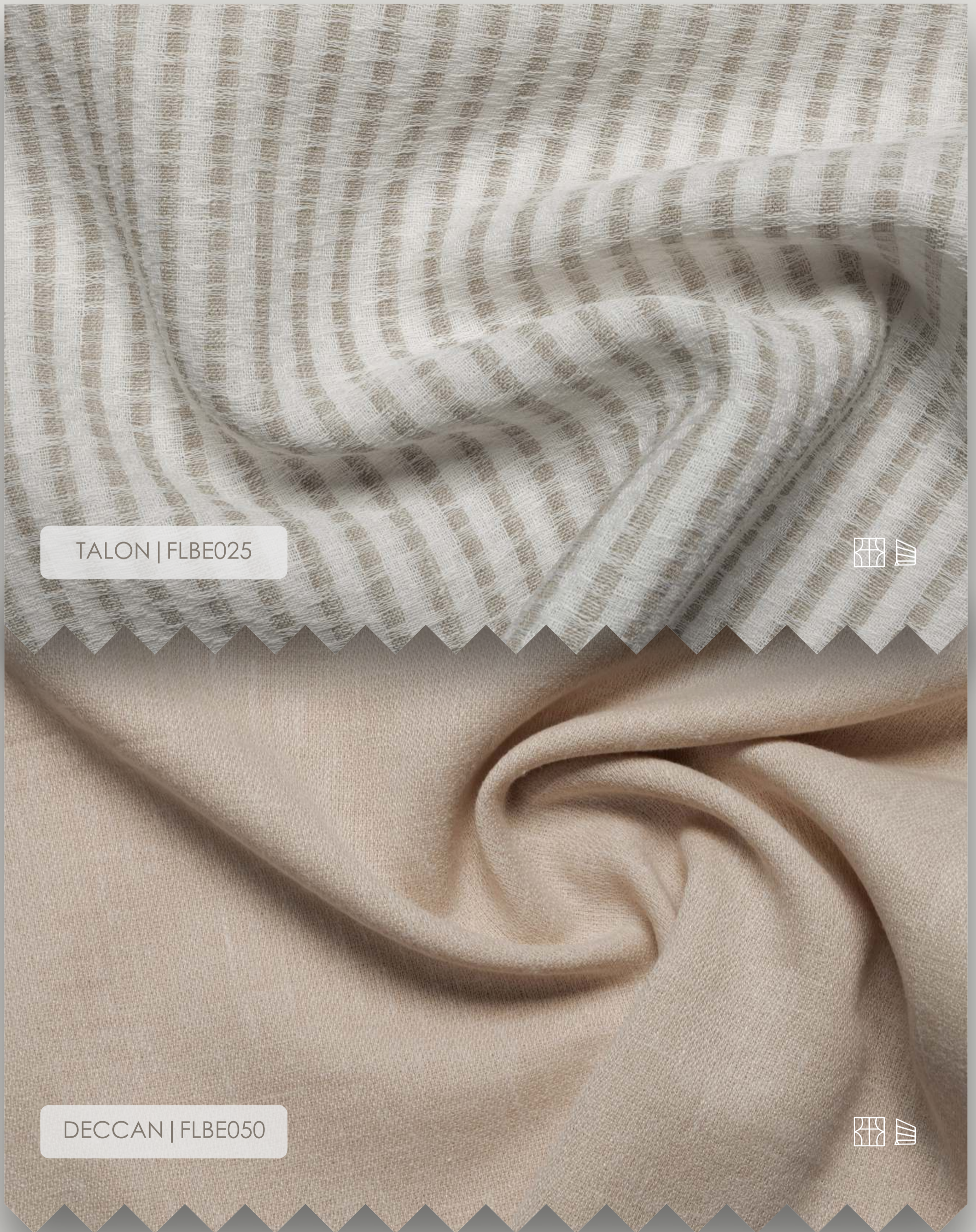
TALON | FLBE025