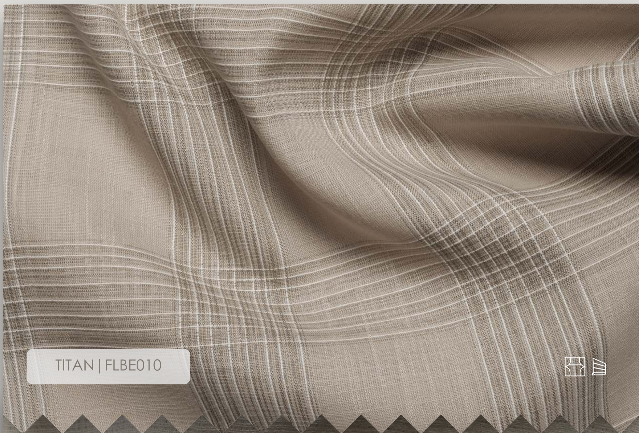
TITAN | FLBE010