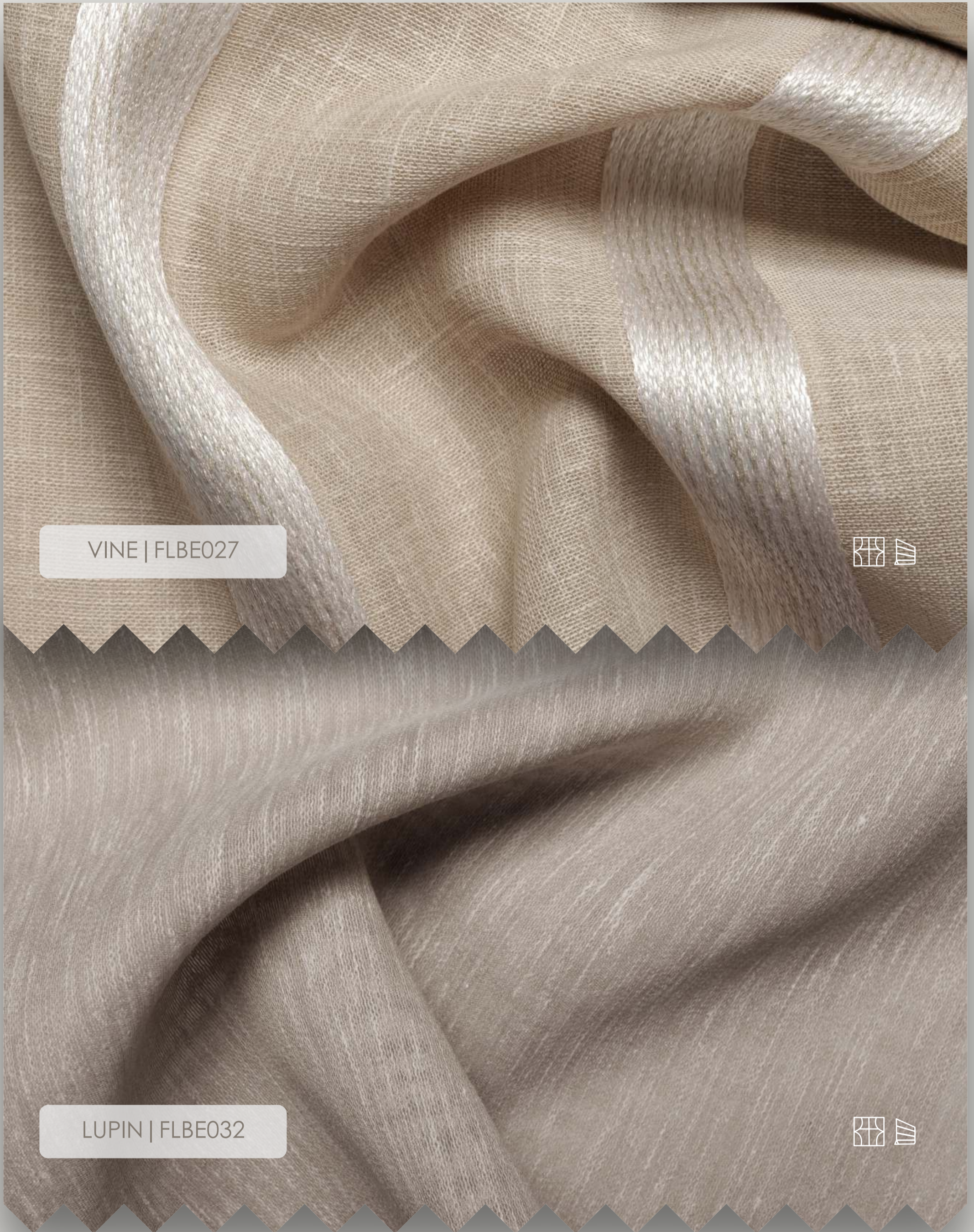
VINE | FLBE027