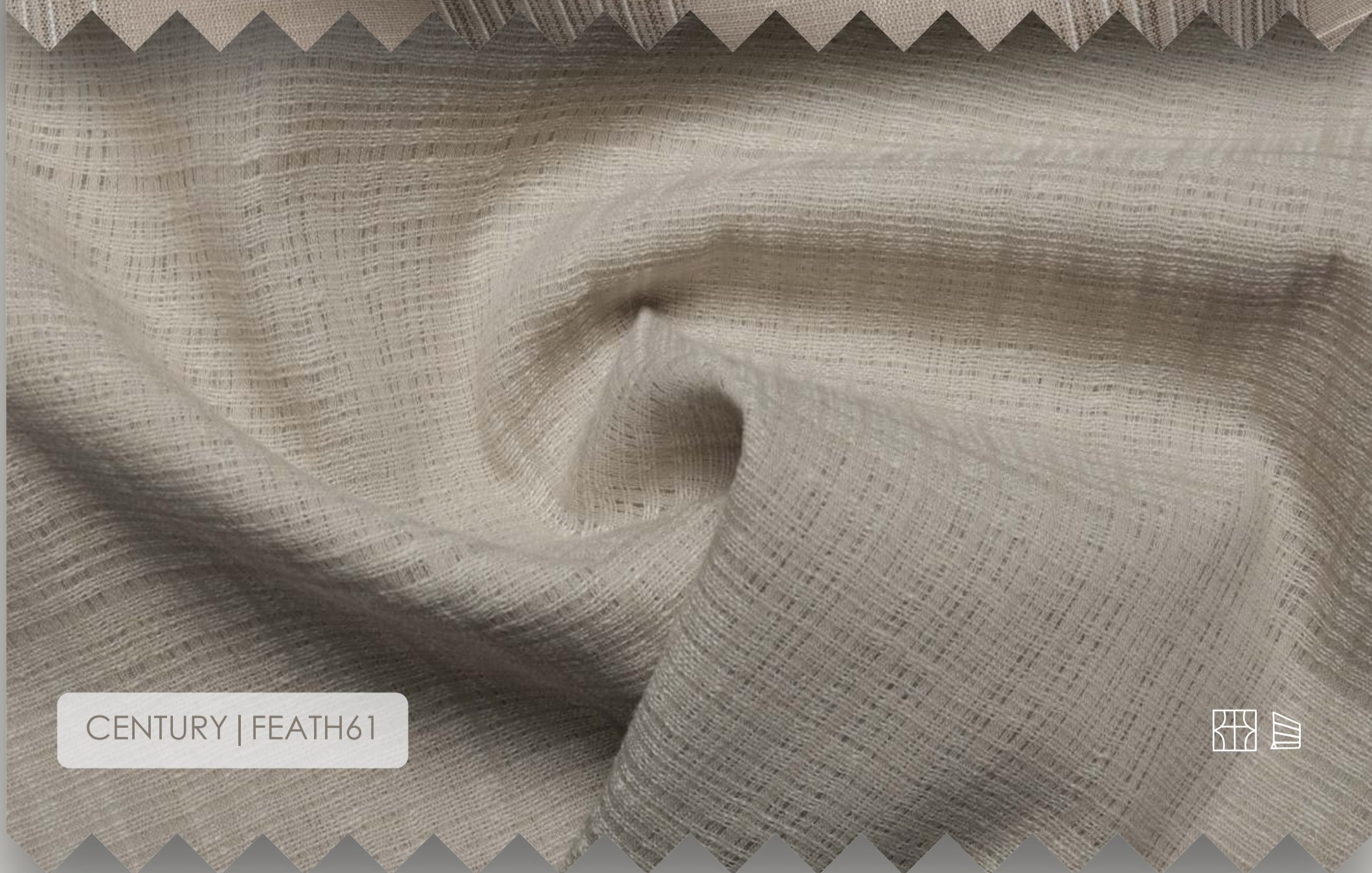
CENTURY | FEATH61