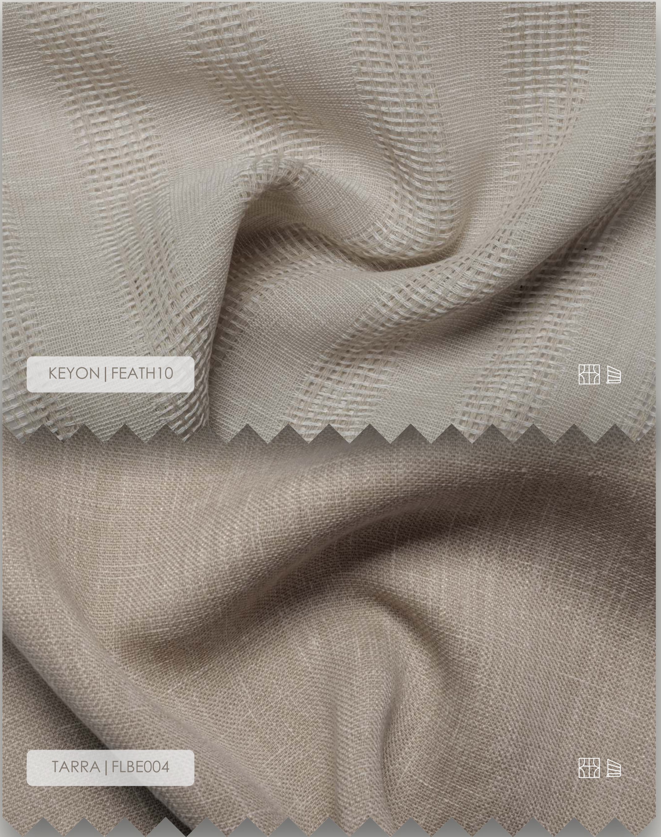
KEYON | FEATH10