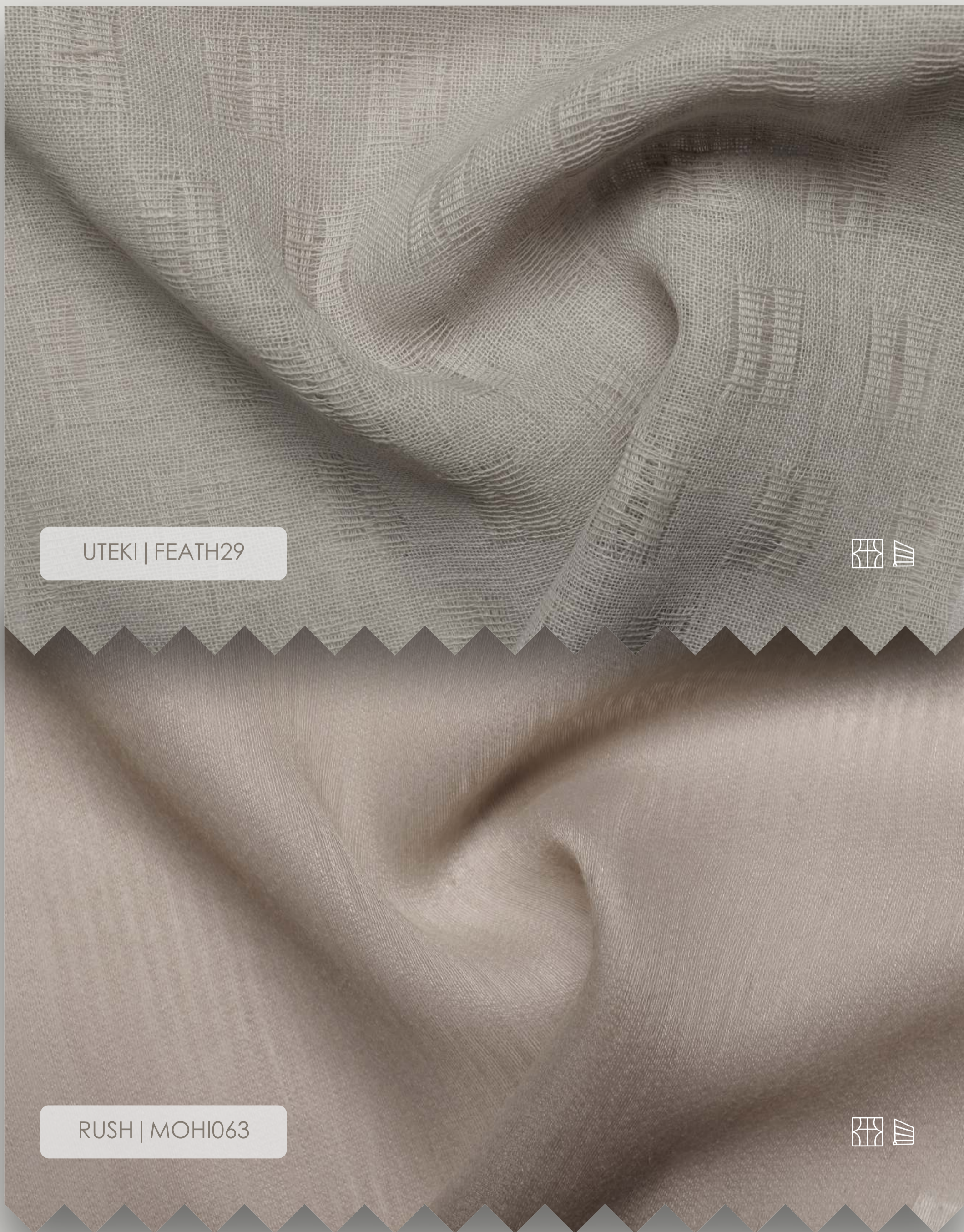
UTEKI | FEATH29