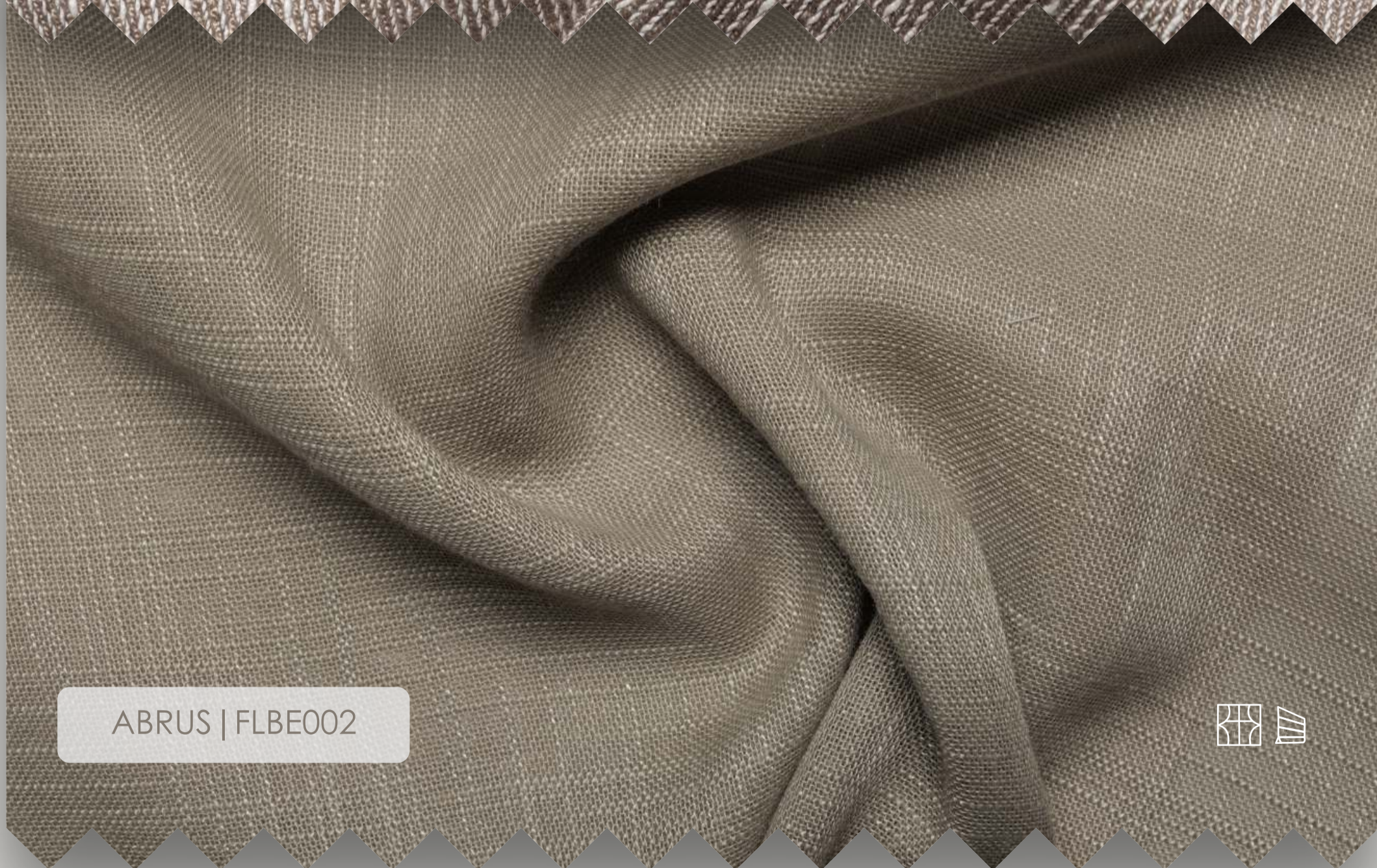
ABRUS | FLBE002