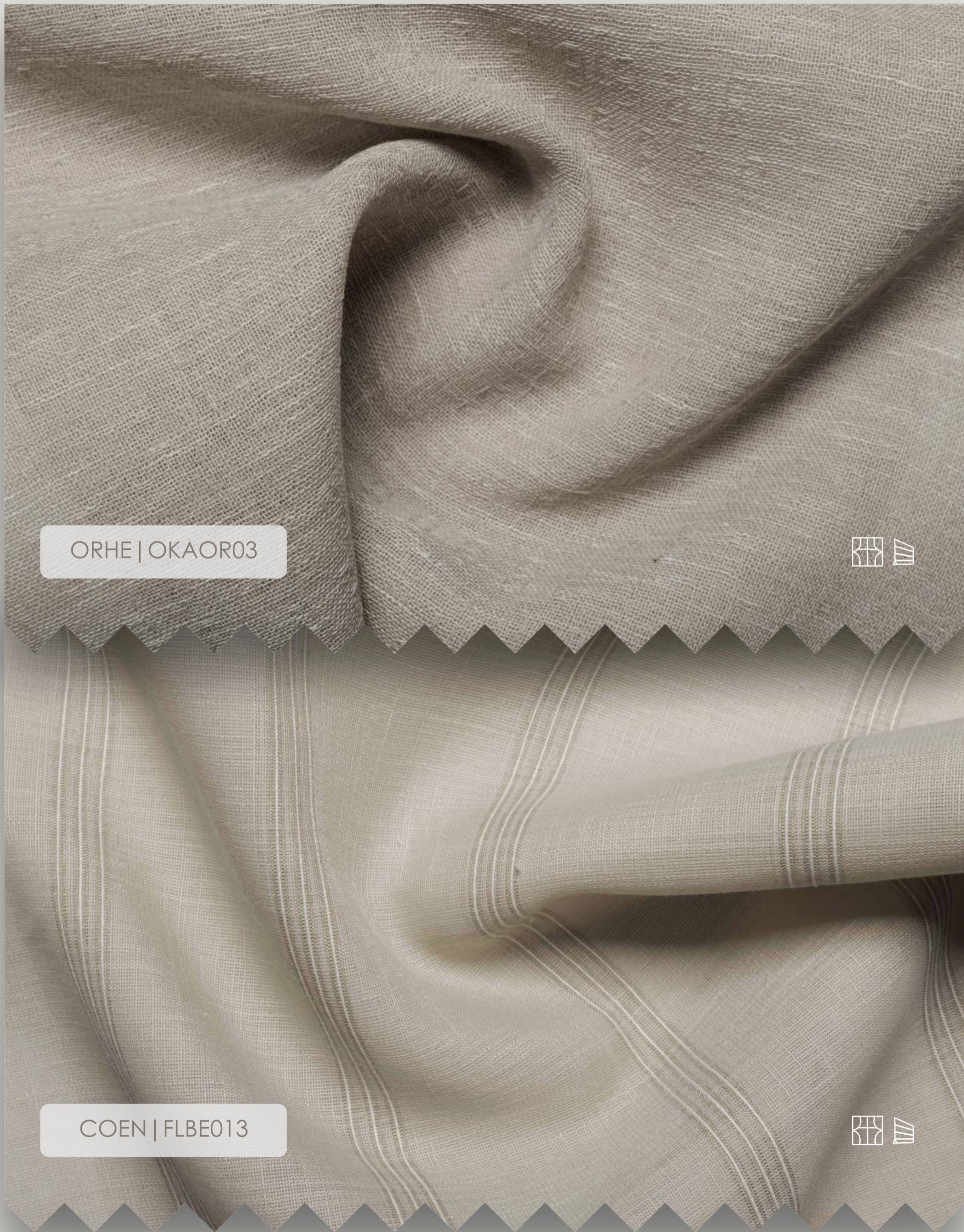
ORHE | OKAOR03