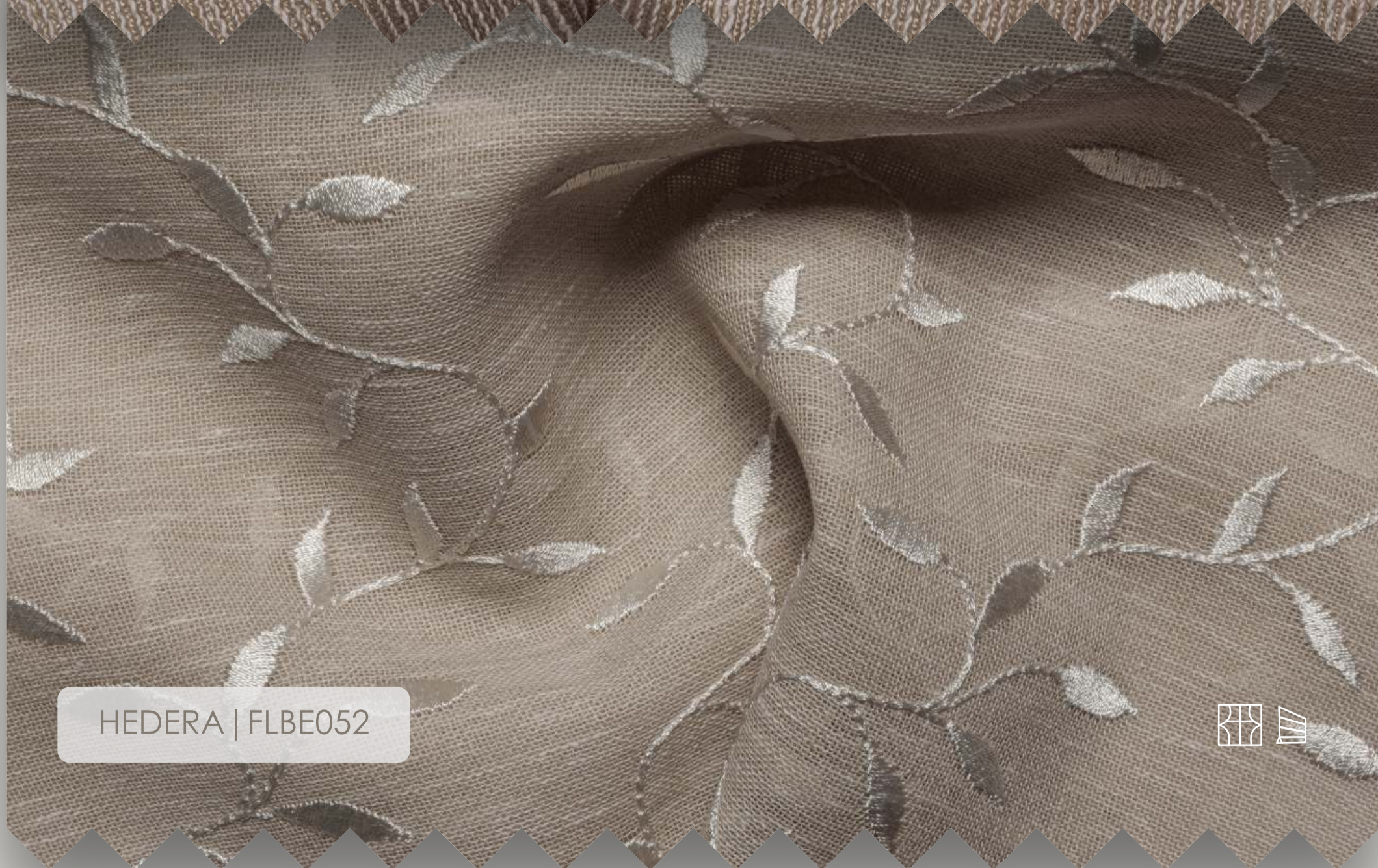
HEDERA | FLBE052