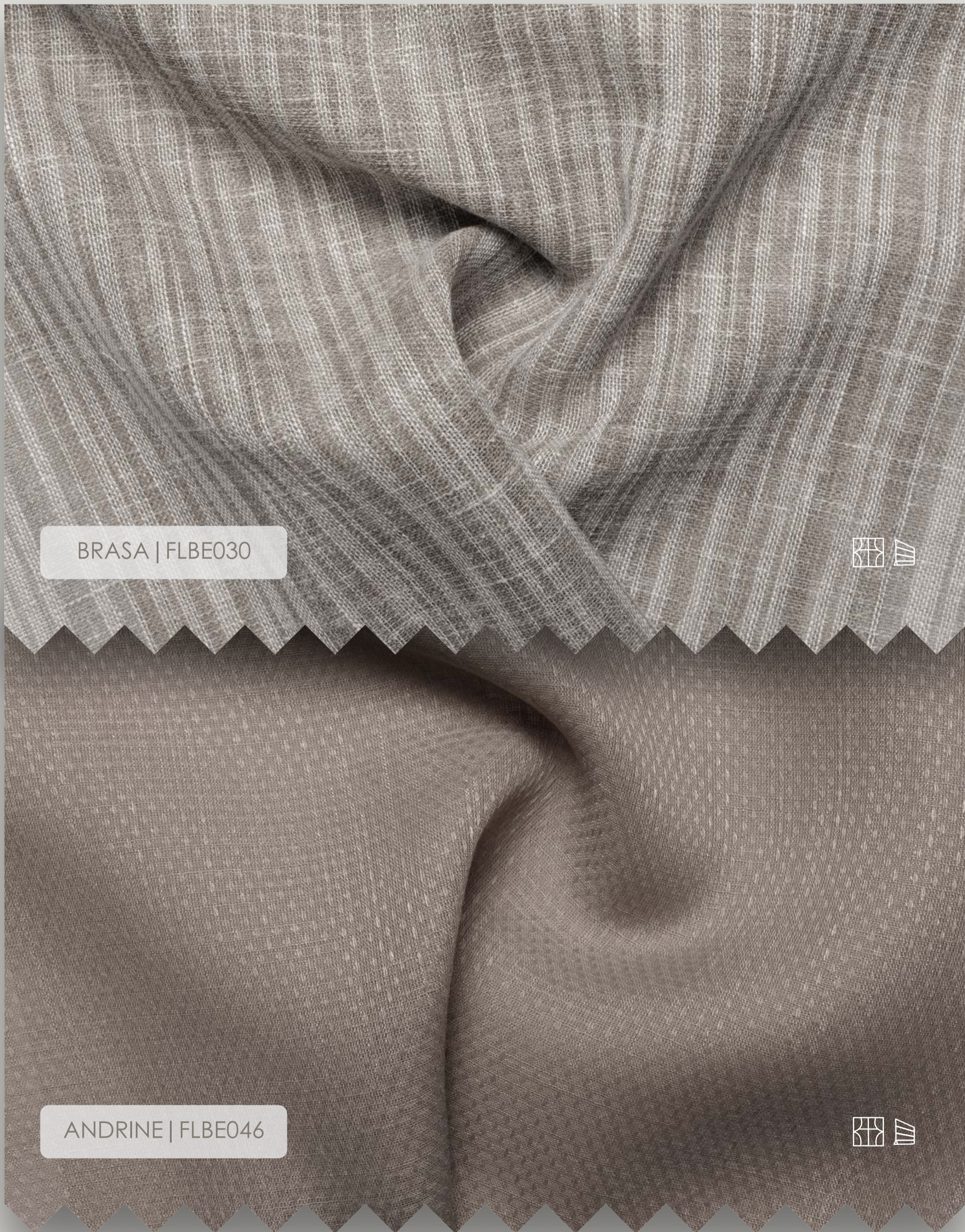
BRASA | FLBE030