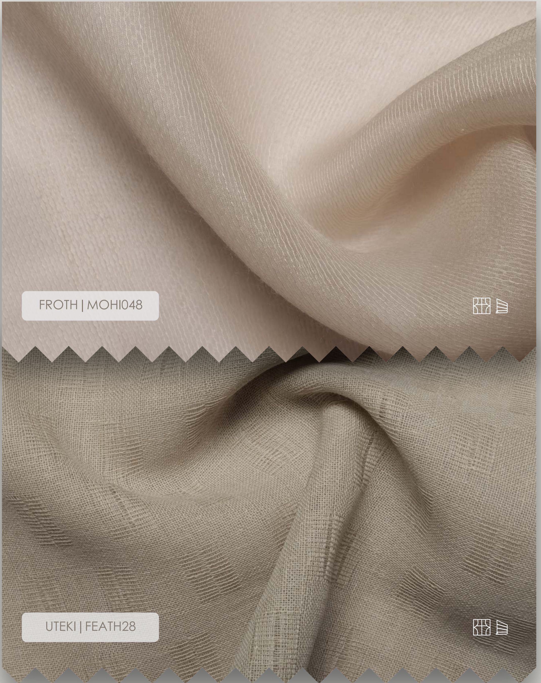
FROTH | MOHI048