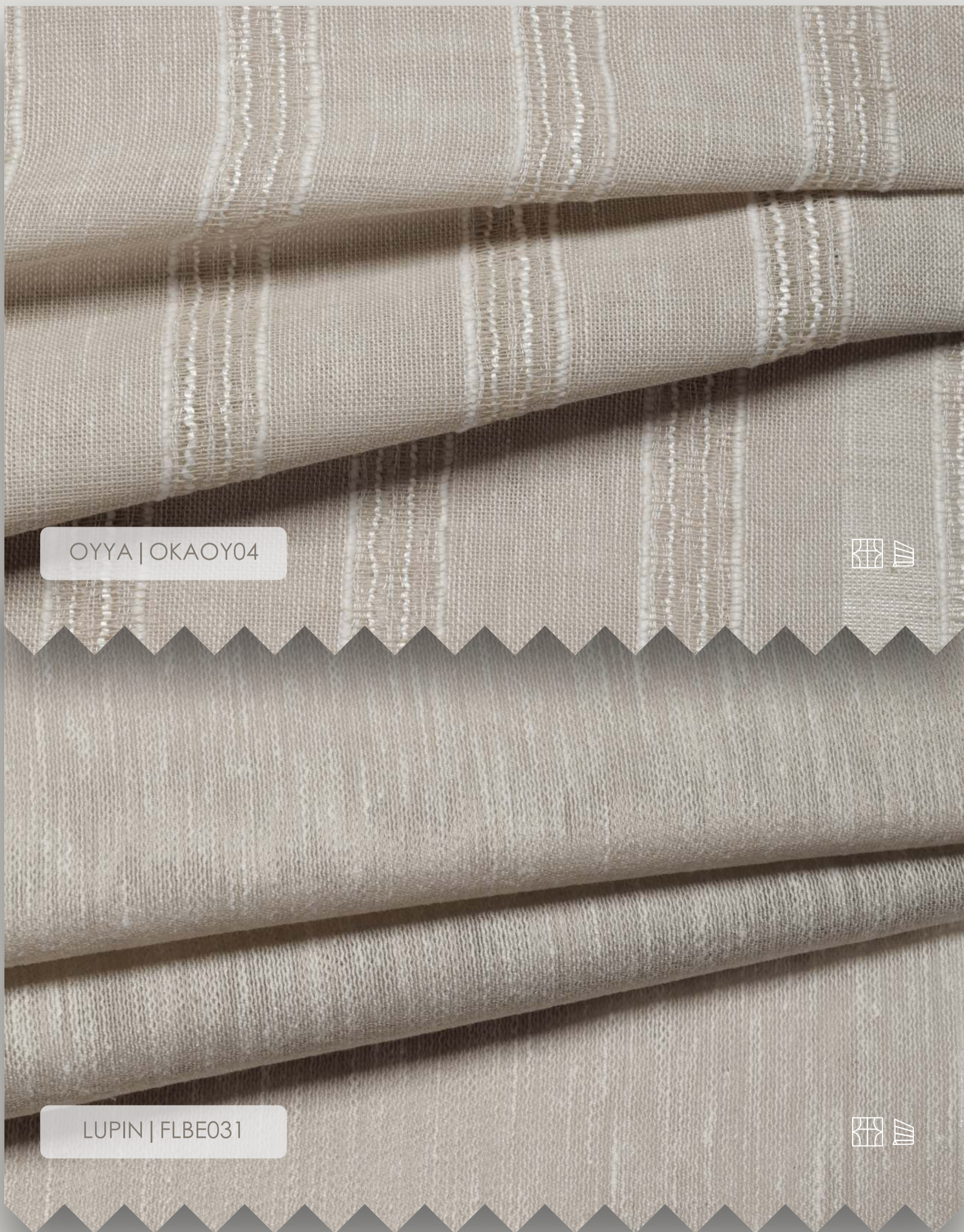
OYYA | OKAOY04