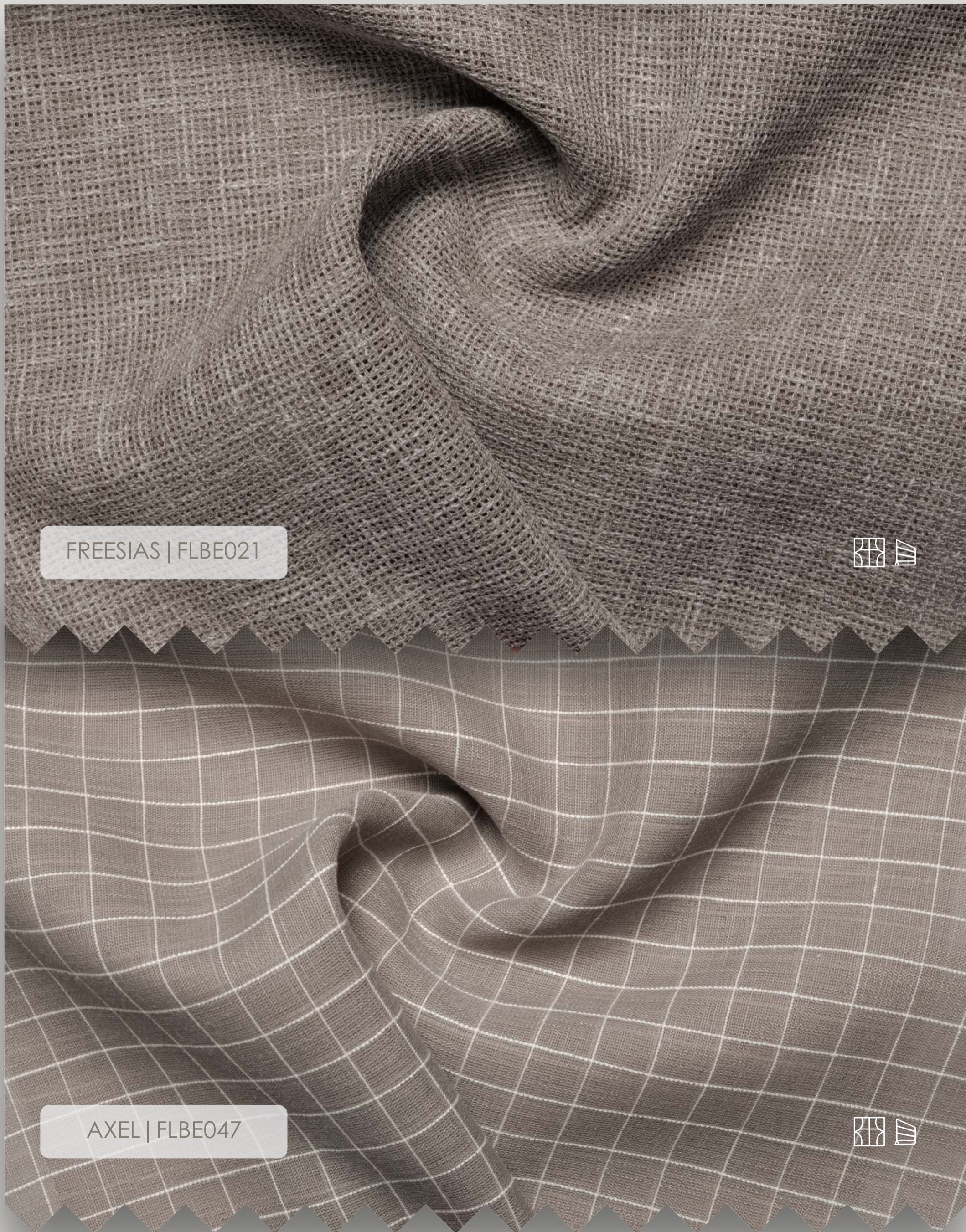
FREESIAS | FLBE021