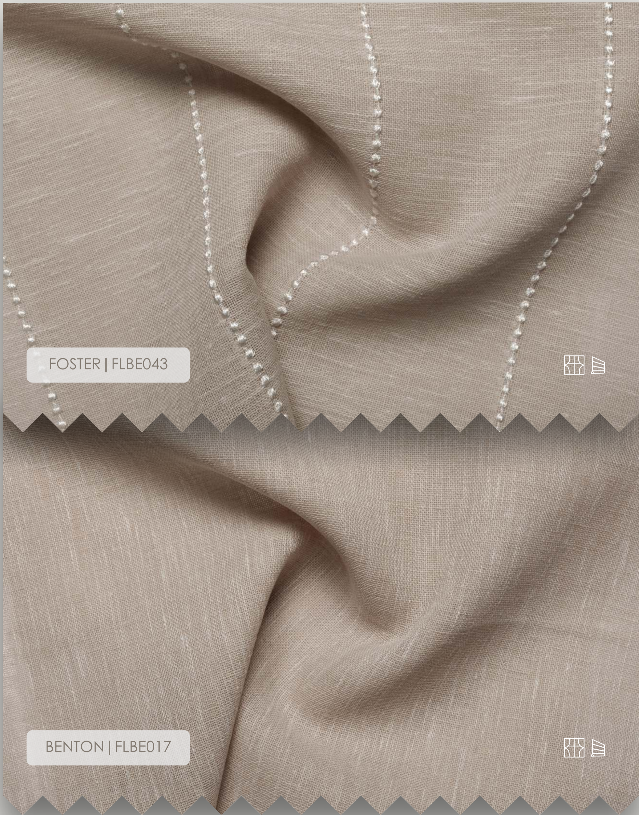
FOSTER | FLBE043