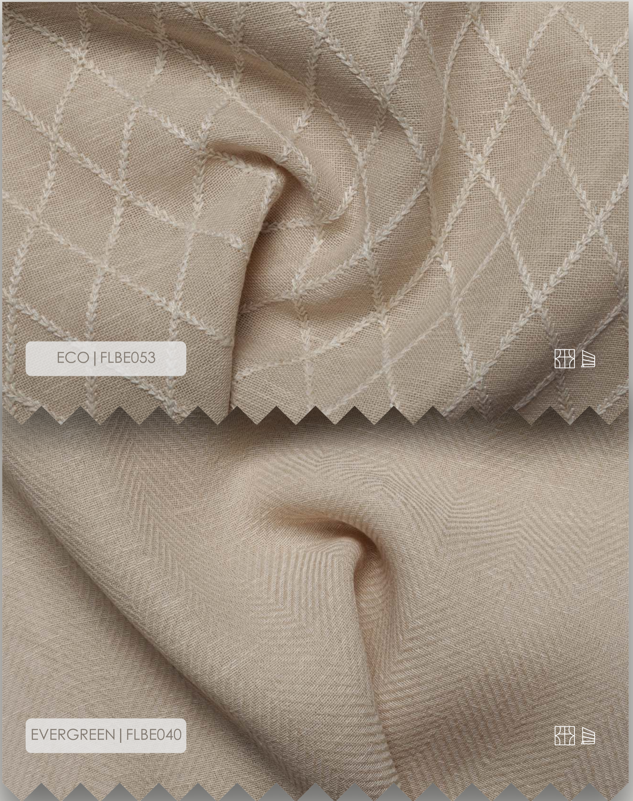
ECO | FLBE053